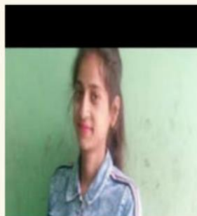
Diksha Data Entry Operator Shimla Cleanways Data Entry Batch 2016-19