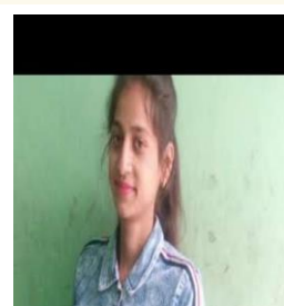
Diksha Data Entry Operator Shimla Cleanways Data Entry Batch 2016-19